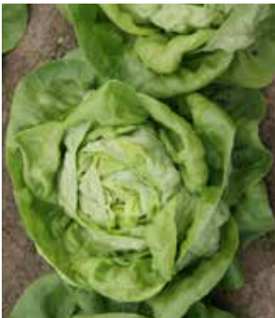
Bremex Butterhead lettuce with high tolerance to bolting Earliest 250 g variety for indoor forcing Recommended for all year field planting