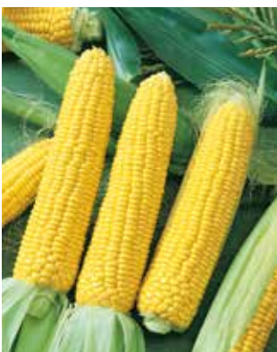
Longa F1 Super sweet (sh2) variety with good health Very early and stress tolerant variety One of the sweetest available hybrids Sugar content up to 35 %