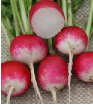
Duo Early two-color radish