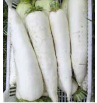
Jarola F1 Daikon radish tolerant to bolting 25-30 cm long and shiny white roots