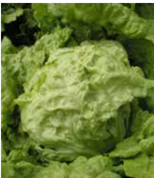
Ledano Iceberg lettuce for spring and autumn cultivation Leaves are slightly blistered and yellow green