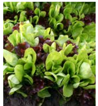
Baby Leaf MIX Mixture of colors and shapes Suitable even for indoor planting